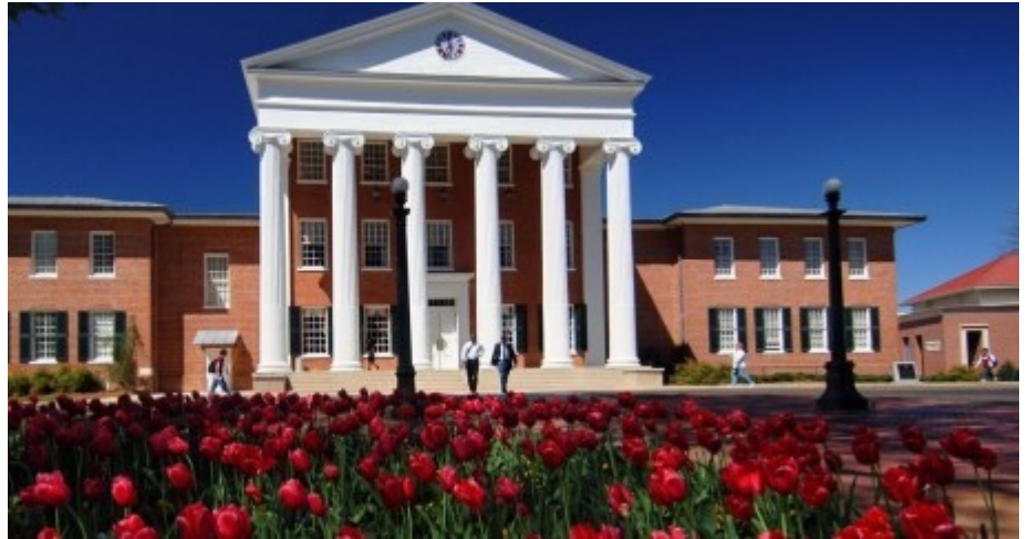
Lyceum at Ole Miss

ADEIL invites you to join us for the 2019 ADEIL Annual Conference, which will be hosted by the University of Mississippi, Division of Outreach! Join us October 15-17, 2019 in Oxford, MS, USA for innovative programming, idea-sharing with knowledgeable colleagues, and even some fun in Oxford!