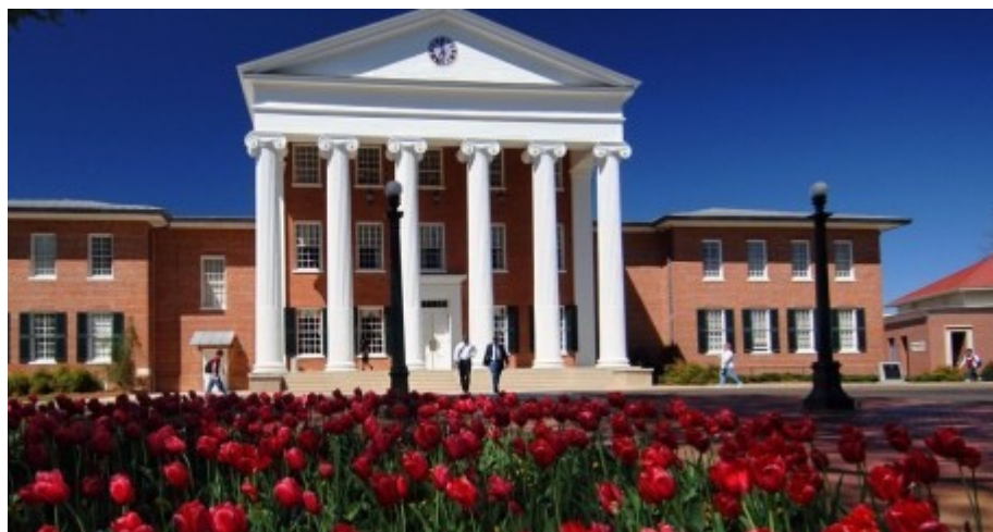
Lyceum at Ole Miss

ADEIL invites you to join us for the 2019 ADEIL Annual Conference, which will be hosted by the University of Mississippi, Division of Outreach! Join us October 15-17, 2019 in Oxford, MS, USA for innovative programming, idea-sharing with knowledgeable colleagues, and even some fun in Oxford!