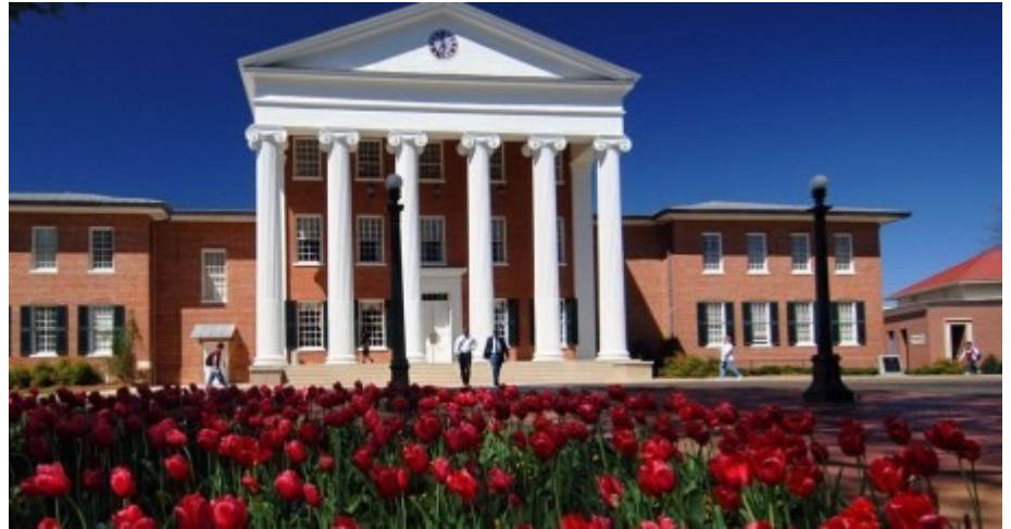
Lyceum at Ole Miss

ADEIL is pleased to announce that the 2019 ADEIL Annual Conference will be hosted by the University of Mississippi, Division of Outreach! Join us October 15-17, 2019 in Oxford, MS, USA for innovative programming, idea-sharing with knowledgeable colleagues, and even some fun in Oxford!